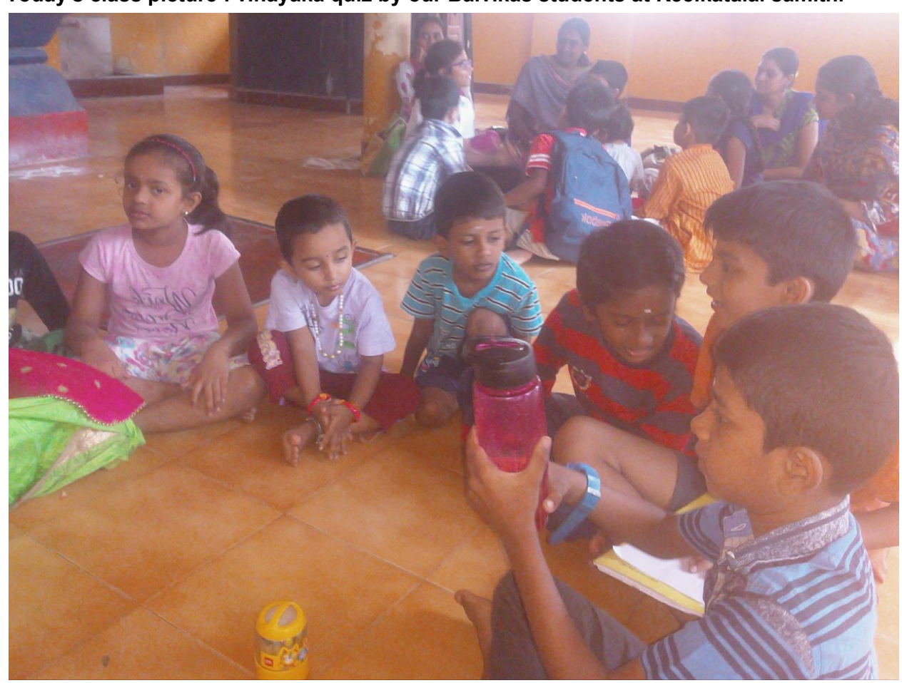
Today's class picture : vinayaka quiz by our Balvikas students at Keelkatalai samithi